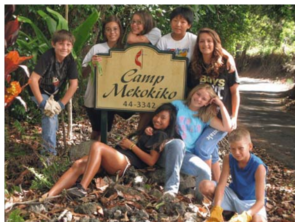
AIEA UMC YOUTH VOLUNTEERS